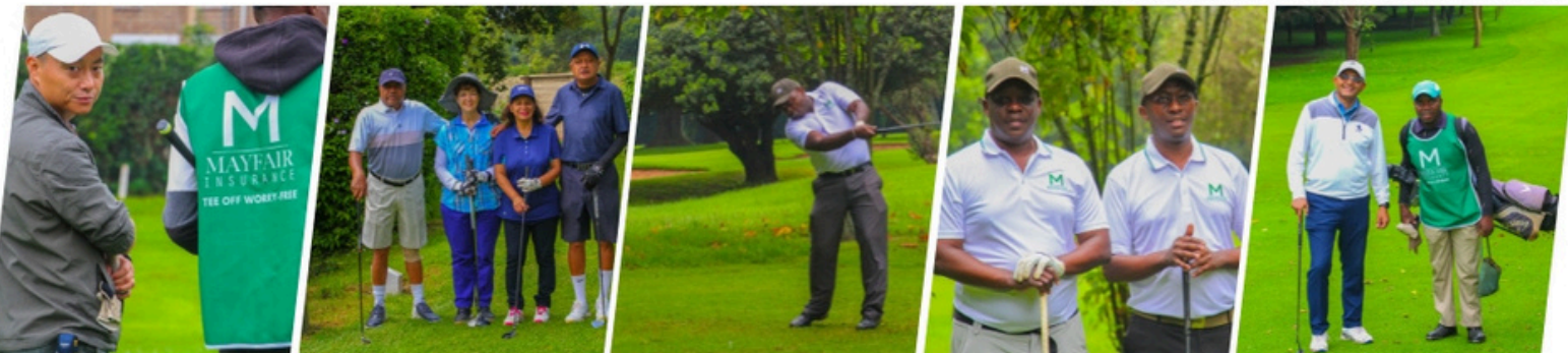
📍 Mayfair Golf Day at Sigona Golf Club

Mayfair Insurance serving you in East, Central and Southern Africa